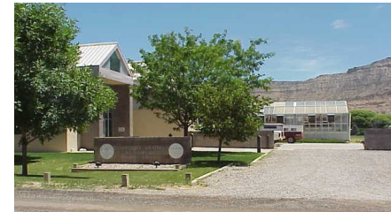
Palisade Insectory - Home of Colorado's Biological control program (CO Dept of Ag)

Effective management occurs over time and requires repeated exposure to the recommended techniques and control methods. After years of investment in mitigating the weeds on your property, the plant will eventually be destroyed.