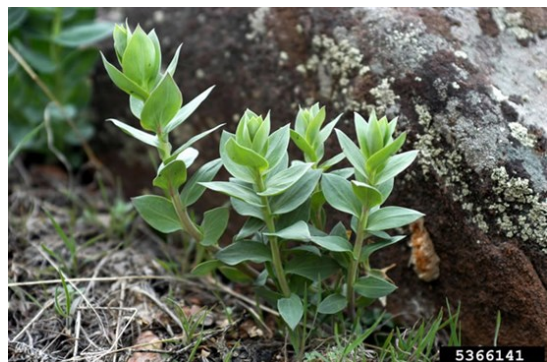
Young Dalmatian toadflax