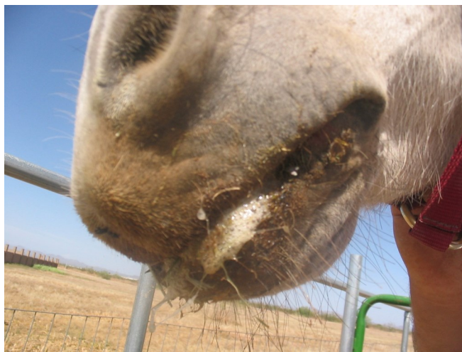
VS blister on a horse

For the most current information about Vesicular Stomatitis in Colorado, go to www.colorado.gov/ag or call the Colorado Department of Agriculture Animal Industry at (303) 869-9130.