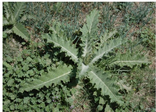
Scotch thistle rosette