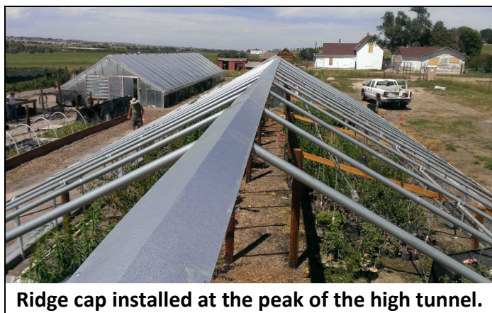
Ridge cap installed at the peak of the high tunnel.

Peak Roof vs. Arched Roof – Hidden Mesa decided on using peak-roofed high tunnels, thinking the peaks would shed snow better. However, with our ever-shining sun in CO, snow melts and sheds just fine on an arched-roof high tunnel. If you choose to use the peak-roofed design, Hough recommends adding a ridge cap at the peak to stop the pointed roof supports from ripping through the plastic in our