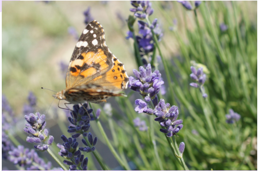
Lavender attracts lots of bees and butterflies.

Their rows are oriented on a south-facing slope, as lavender likes full sun and good drainage. Heavy