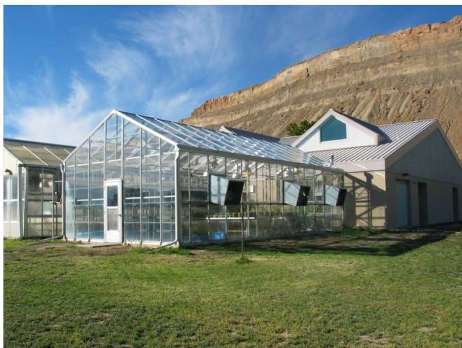
Palisade Insectary and Greenhouse