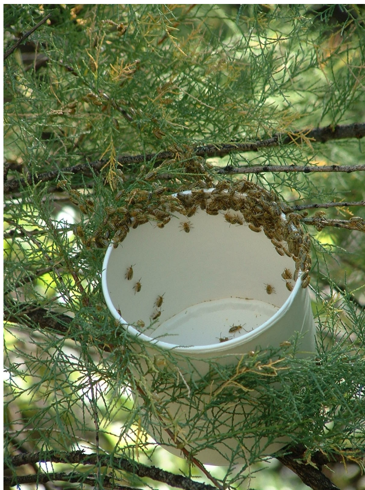
Releasing tamarisk beetles