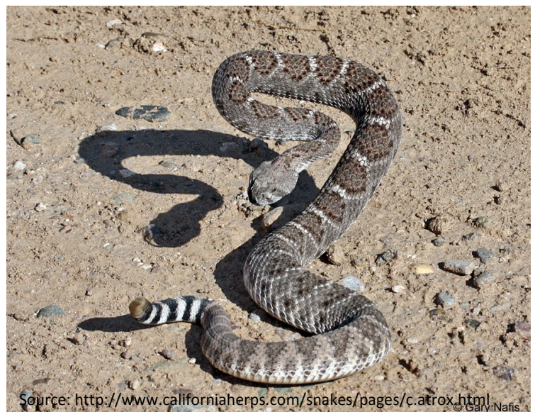
Western diamondback rattlesnake in typical defense posture.